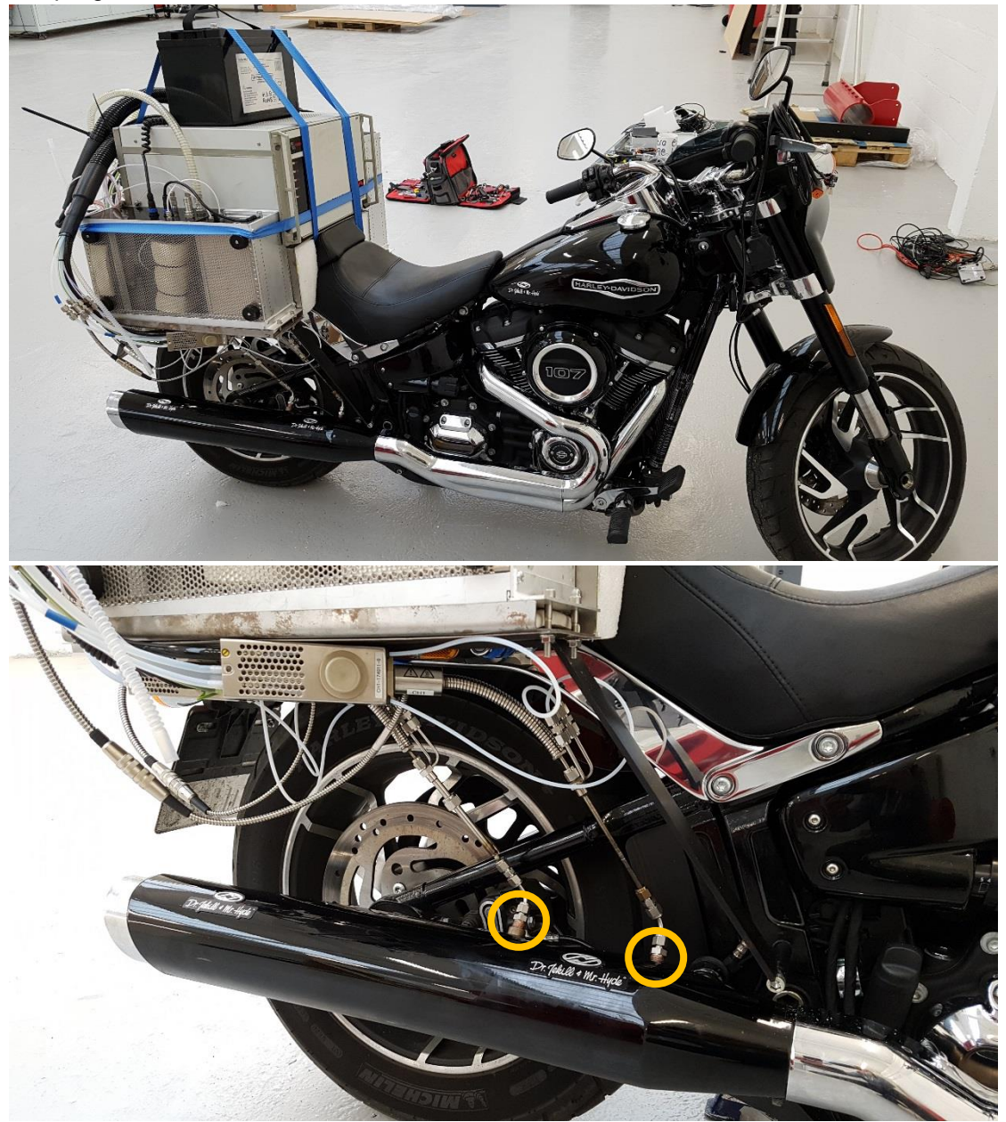
Figure 1: Two-channel fast NOx analyzer sampling engine-out and tailpipe [NO] The bike was then driven on a "condensed RDE" route around Cambridge involving urban, rural and motorway sections of total duration approximately 1 hour.

A joint project between <u>Cambustion</u> and <u>The Dr. Jekill and Mr. Hyde Company</u> was undertaken using a port-fuel-injected two-cylinder Harley-Davidson Sport glide 107 motorcycle. This was with a view to measuring the transient emissions performance of the factory-delivered bike before the substitution of a Jekill & Hyde aftermarket exhaust system. The bike was instrumented with fast NO sample probes fitted immediately upstream and downstream of its catalytic converter and the Cambustion CLD500 fast NOx analyzer (in mobile configuration) was supported on the rear passenger seat, weighing approximately 65kg. The analyzer was powered by a LiFePo supplying sufficient power for two hours of sampling.